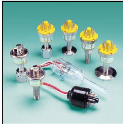
Thermocouple Gauge Tubes